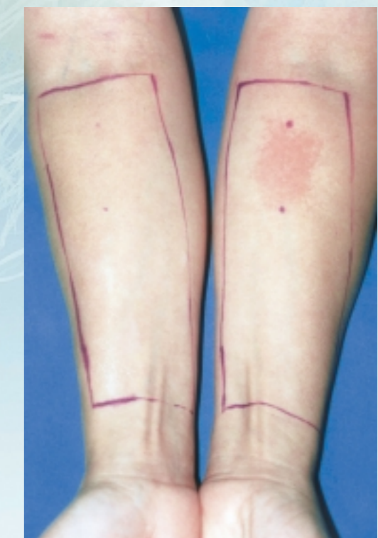
Protected arm Unprotected arm