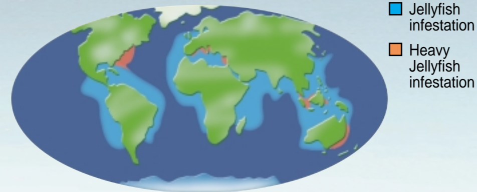
World jellyfish distribution